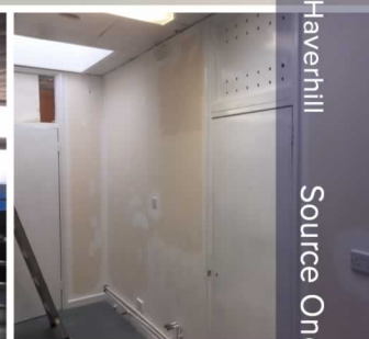
Middle images: Prior to work and in progress